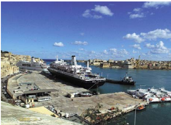
Cruise liners in the Grand Harbour of Valletta.

Phoenicians, Carthaginians and Romans left their traces, to be followed by Arabs and Normans. The Knights of the order of St John made the island their headquarters from the 16 th century and built great fortifications, palaces, public buildings and St John's Cathedral with its eight ornate chapels dedicated to each of the lingues or nations of the Order.