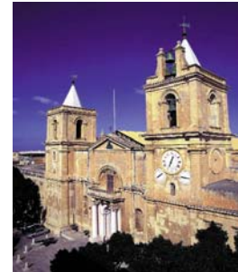
St John's Co-Cathedral built by the Knights of Malta.

Maltese life is sharply focused on the extended family where parents are revered and children are passionately loved.