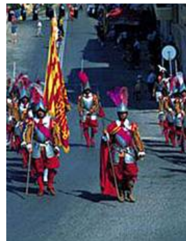
One of Malta's many festivals – celebrating 7,000 years of culture on the island of Gozo.

Feb 3 - Feb 8: Carnival Mar 10 - 13: Mediterranean Food Festival Mar 20 - 27: Holy Week Festival May 6 - 7: Fireworks Festival July 15 - 17: Jazz Festival Sep 24 - 25: Malta International Airshow Oct 6 - Oct 16: The Malta Historic Cities Festival Oct 22 - 29: The Rolex Middle Sea Race Nov 7 - 11: International Choir Festival